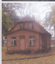
Clockwise from left: a house in Jurmala; Amber Spa; a felt banya hat; dentist's chair in the sanatorium's museum