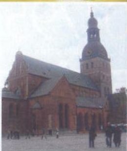
Clockwise from right: Jurmala beach; Riga's oldest street; the cathedral