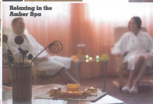
Relaxing in the Amber Spa